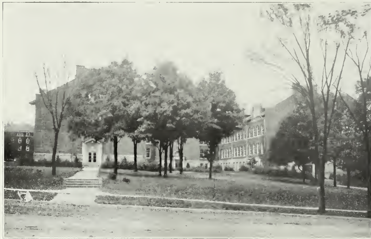
McGUFFEY HALL—TEACHERS COLLEGE BUILDING

McGuffey Hall is named in honor of William Holmes McGuffey, who wrote the McGuffey Readers while a professor in the University 1826-36.